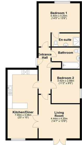
Total area: approx. 79.9 sq. metres (860.0 sq. feet) Floorplans are for guidance purposes only and should not be taken as accurate. Brookes Bliss Ltd Plan produced using PlanUp.